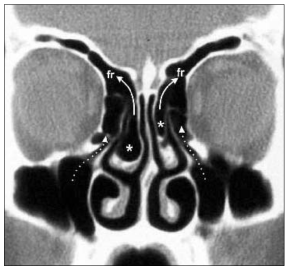
Figure 3. On the coronal CT image, there is extensive type concha bullosa ( asterisk ) on the right and lamellar type on the left. Both drain into the frontal recesses (fr) and both recesses are open ( arrows ). Both ostiomeatal units are open ( dashed arrows ).