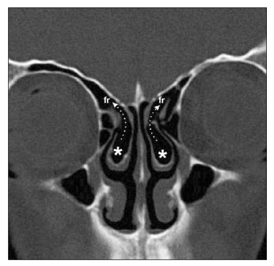
Figure 2. On the coronal CT image, the ostium of extensive type concha bullosa ( asterisk ) on both sides drain into the frontal recesses (fr) and both recesses are open ( dashed arrows ).