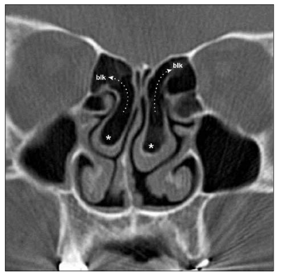
Figure 4. Extensive type concha bullosa ( asterisk ) ostium drains into the air cells adjacent to the basal lamina (blk) on both sides ( dashed arrows ) on this coronal CT image. There is prominent mucosal thickening in the right maxillary sinus.