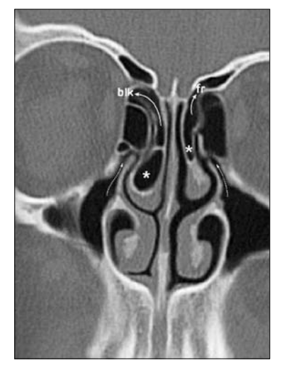
Figure 1. On the coronal CT image, lamellar concha bullosa ( asterisk ) drains into the frontal recess (fr) on the left and the left frontal recess is open. On the right, extensive type concha bullosa ( asterisk ) drains into the air cells adjacent to the basal lamina (blk) ( arrows ). Both ostiomeatal units are open ( dashed arrows ).